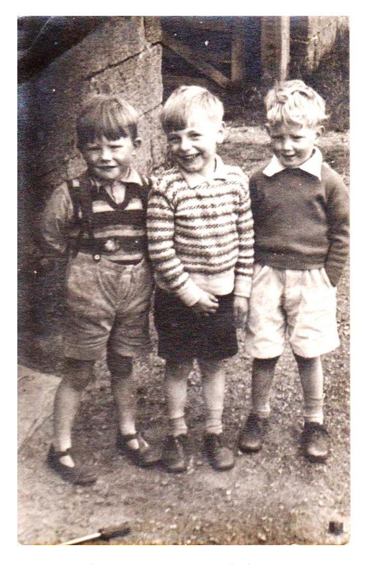
'The Three Musketeers' of Hepple